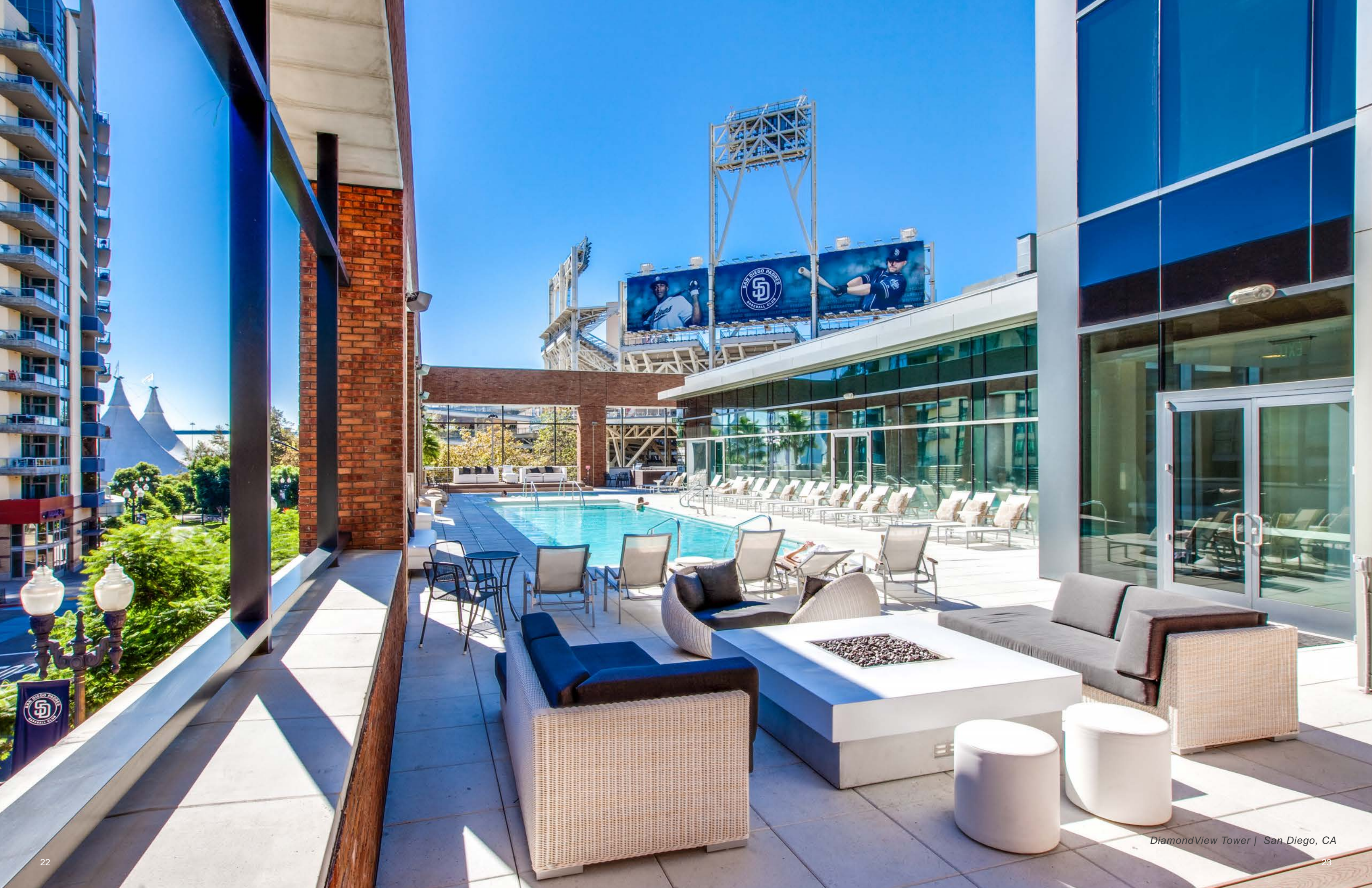
DiamondView Tower | San Diego, CA