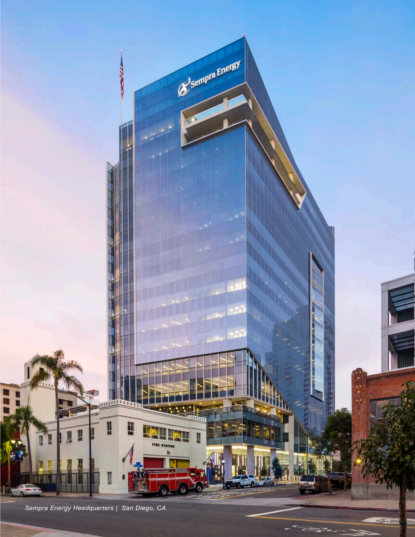
Semptra Energy Headquarters | San Diego, CA

Interestingly, the prior owner of 101 Ash was contemplating several options after Semptra Energy moved out of the building and Cisterra was able to structure with them a contribution of the asset to a new entity controlled by Cisterra that met each of the partners in that entity’s financial goals. Overall, all stakeholders achieved maximum value and flexibility.