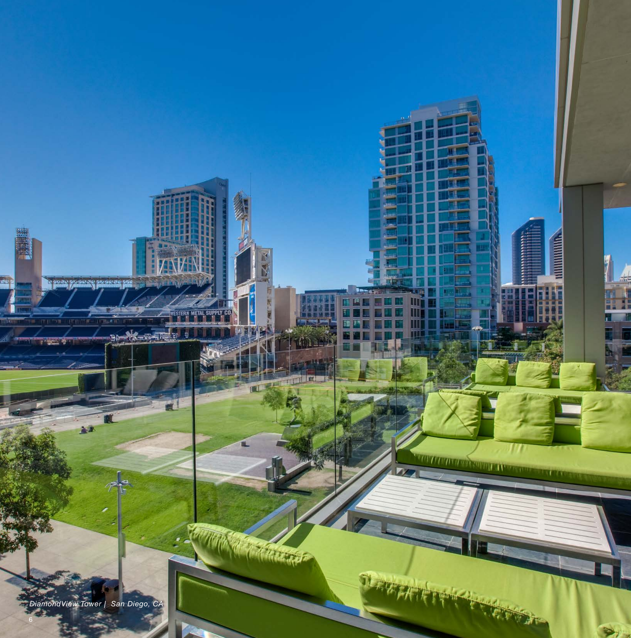
DiamondView Tower | San Diego, CA