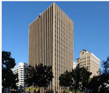
CIVIC CENTER PLAZA